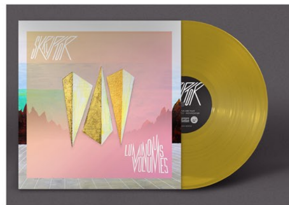
Available as a Deluxe Colored Vinyl LP and MOD CD...

Album includes Gold-Vinyl LP Collectible Wrap-Around OBI and Full-Color Inner Sleeve PR campaign by Curran Reynolds